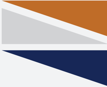
Geometric color fields for use on social headers as accents, or small graphics.